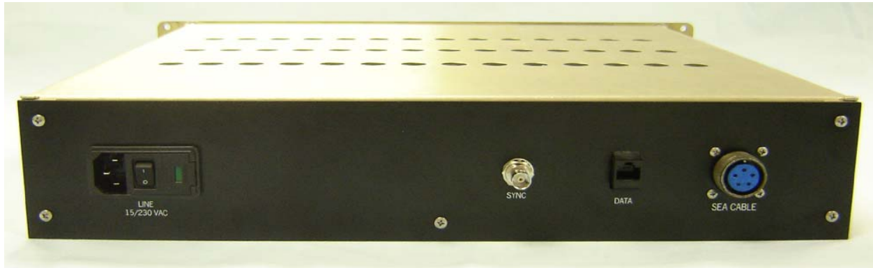
Rear panel of 701-DL